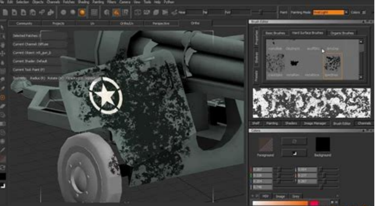
Mari 3d vs substance painter. What is substance painter used for. Mari vs substance painter 2021. Is substance painter worth it. Mari vs substance painter reddit. Foundry mari vs substance painter.